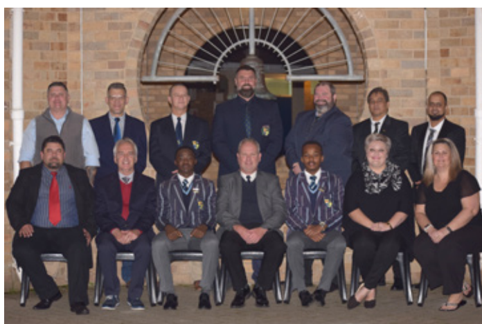
School Governing Body