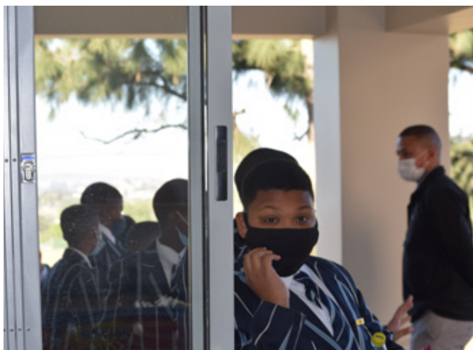
A new tuckshop was built opposite the Muirite Clubhouse and is finally up and running