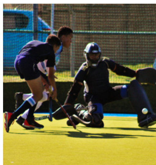
Hockey vs Westering