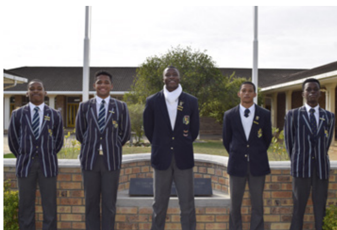
Top academic achievers for the first term earning their gold badges. The requirements are to obtain 80% and above