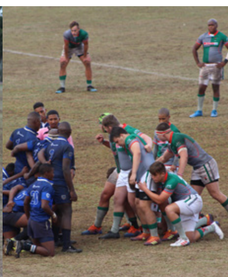
Rugby vs Brandwag